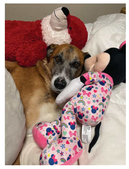
Artemis in foster care