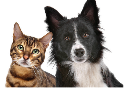
Join us for a fun and fabulous week featuring exclusive online silent and live auctions and adorable animal highlights. The Toast for Tails 2021 celebration is SoHumane's most significant fundraiser of the year to support pets in need and the people who love them. Experience the heartwarming satisfaction that comes from saving the life of a homeless dog or cat.

Save the Date! A Toast for Tails May 10-15, 2021